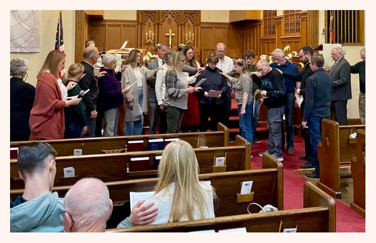
Serving Your Church